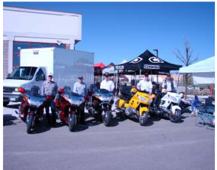
Great turn-out for the Chapter Meet and Greet!