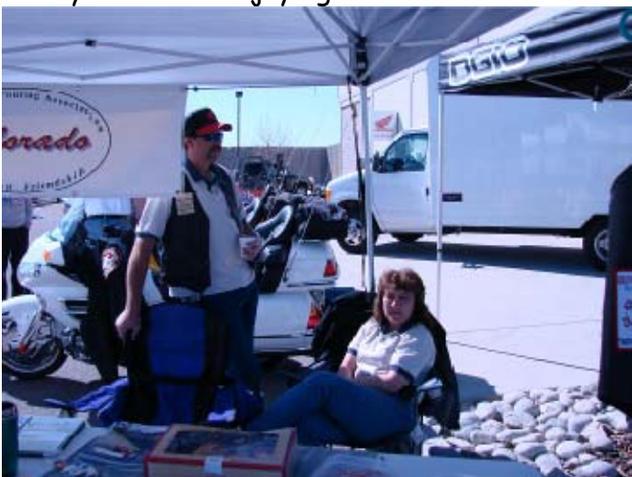
Enticing new members—and supporting Interstate Honda